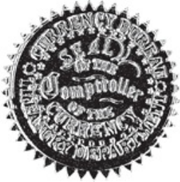
Comptroller of the Currency

IN TESTIMONY WHEREOF, today, February 27, 2013, I have hereunto subscribed my name and caused my seal of office to be affixed to these presents at the U.S. Department of the Treasury, in the City of Washington, District of Columbia.