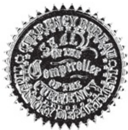
Comptroller of the Currency

IN TESTIMONY WHEREOF, today, February 27, 2013, I have hereunto subscribed my name and caused my seal of office to be affixed to these presents at the U.S. Department of the Treasury, in the City of Washington, District of Columbia.